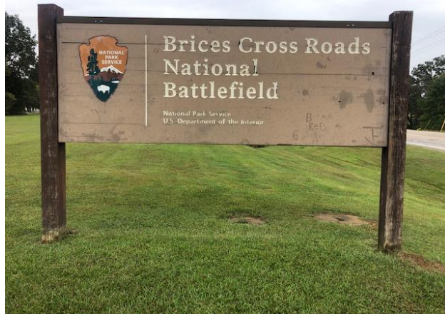
A tour of Brice's Crossroad's Battlefield was a unique experience during the living history.