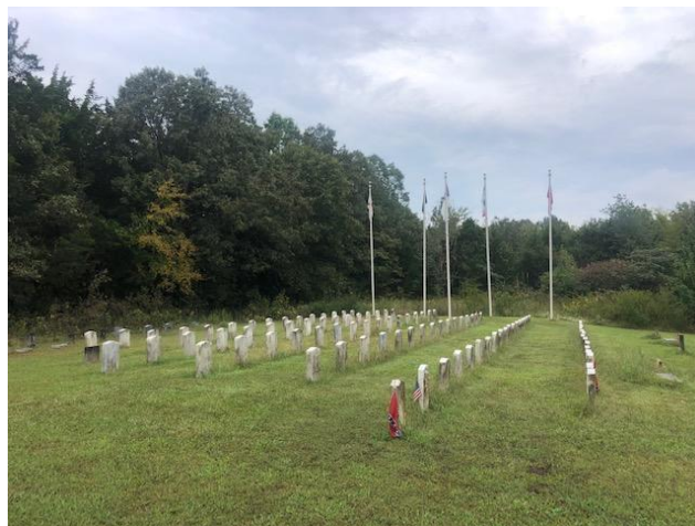
The Cemetery at Brice's Crossroads is well kept and a pleasure to visit..