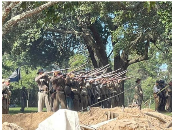
The Shieldsboro Rifles prepare to fire a volley into the Yankee Horde during Fall Muster.