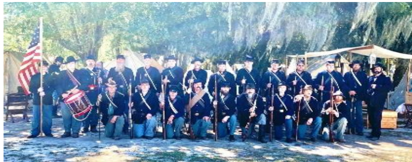
The 9 th Connecticut Infantry formed up on Sunday October 17, 2021 for Fall Muster.