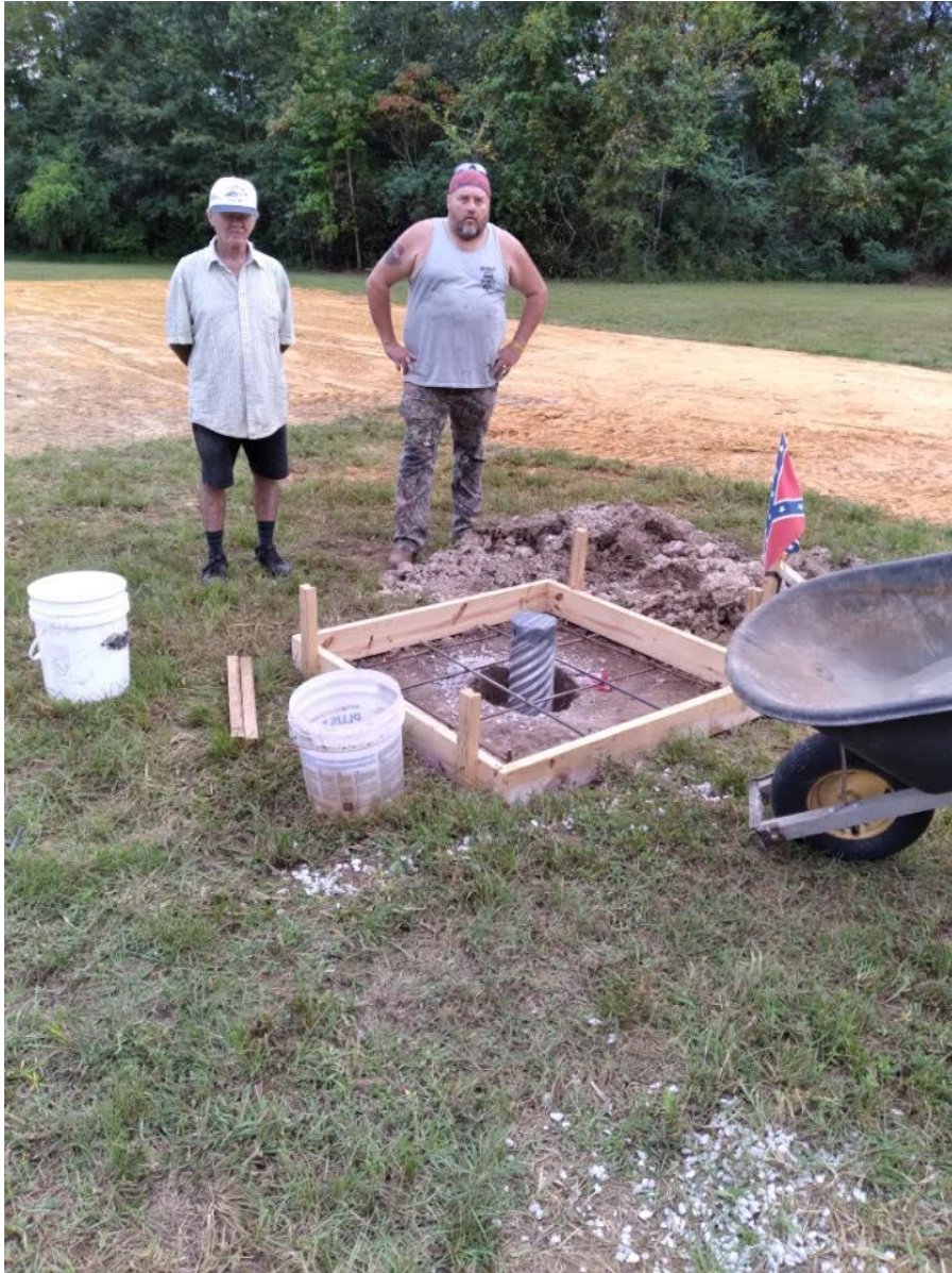
The Calhoun Avengers Camp 1969 are still working on the new monument site. This week they poured their first of many flagpole bases.