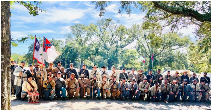
The Shieldsboro Rifles fielded 39 total soldiers at Fall Muster on Saturday at Beauvoir..